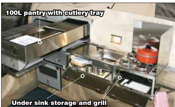
100L pantry with cutlery tray