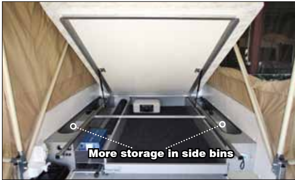
More storage in side bins

Aussie Swag campers have stacks of storage. The Rover LX , Explorer and Ultra all have a huge, slide out, under bed storage drawer which can also be accessed when the camper is closed through the rear tailgate. There is plenty of space in the side bins beside the bed, and there is also enough room on top of the bed to carry a fold up table and two chairs with the bed made up. The area above the battery bin is also useful for storing items that need to be accessed often through the tailgate.