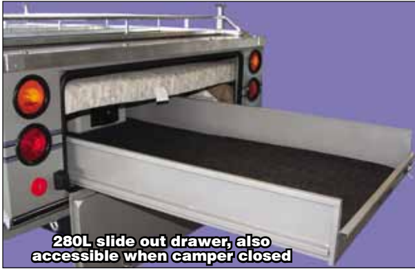
280L slide out drawer, also accessible when camper closed

Aussie Swag campers have stacks of storage. The Rover LX , Explorer and Ultra all have a huge, slide out, under bed storage drawer which can also be accessed when the camper is closed through the rear tailgate. There is plenty of space in the side bins beside the bed, and there is also enough room on top of the bed to carry a fold up table and two chairs with the bed made up. The area above the battery bin is also useful for storing items that need to be accessed often through the tailgate.