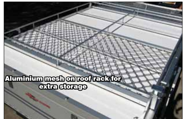
Aluminium mesh on roof rack for extra storage